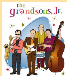
The Grandson's Jr.