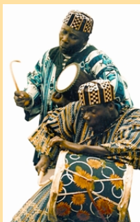
*Anansegromma - solo or duo