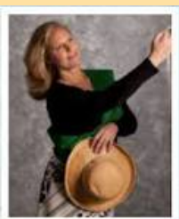
*RC Dance Discovery